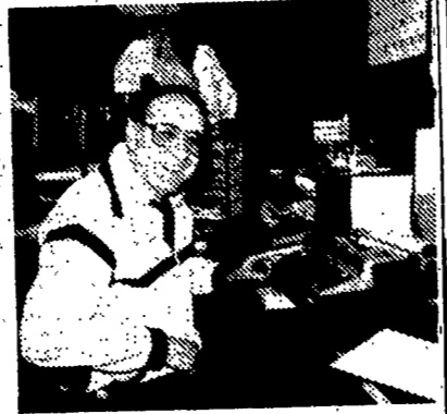
by Bud Besser

We checked into an Orlando, Florida motel just hours before the Gulf War began last Wednesday. We were starting a 12 day vacation by visiting Epcot. Our last week would be lounging down in the West Palm Beach area.